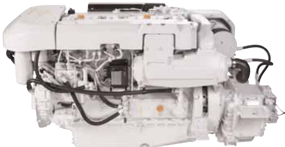
6CX-530 with KMH70A

Dimensions (For detailed line-drawings, please refer to our web-site: www.yanmarmarine.com )